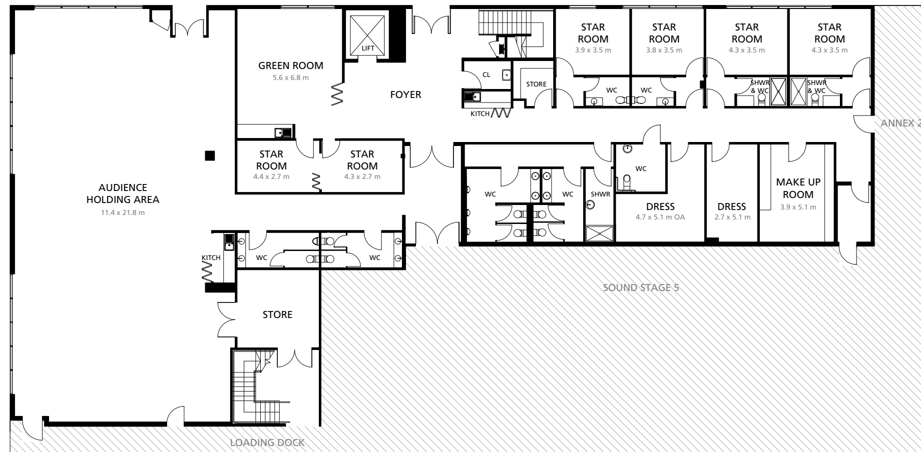
1 GROUND LEVEL PLAN

AUDIENCE HOLDING AREA 270 m 2 / 2,910 ft 2